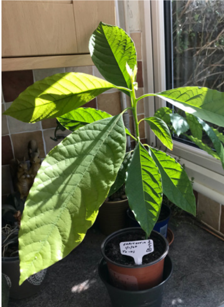
Avocado plant at the end of May 2020, 8 months after starting at the beginning of October 2019