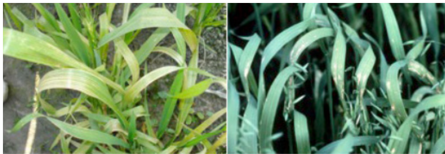
Manganese deficiency symptoms in corn and wheat (Pictures: IPNI).

Manganese has a relatively low phloem mobility in plants, and as a result, typical leaf symptoms of Mn deficiency first develop in younger leaves. The critical concentration for Mn deficiency is generally below 20 ppm dry weight in fully expanded, young leaves. In the case of dicots, Mn deficiency first results in pale mottled leaves, followed by typical interveinal chlorosis. Under severe Mn deficiency dicots may also develop a number of brownish spots. In cereals, Mn deficiency can cause pale green or yellow patches in younger leaves. This condition is known as grey speck, and is characterized by necrotic spots that form in older leaves (Figure 1).