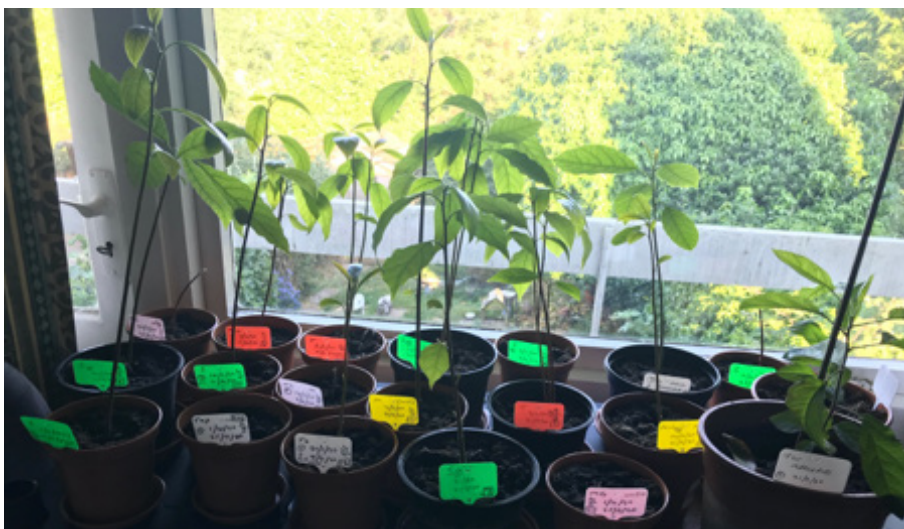
S-Chelate-O 12 Star vs competing fertilisers ready to use solutions with Avocado stones mounted in jars and as feed after germination and potting