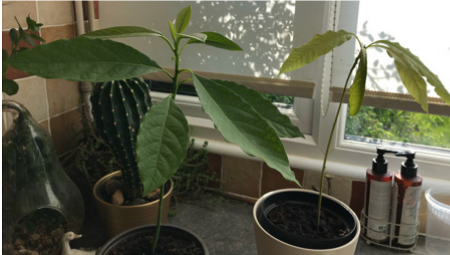
Avocado plant at the end of May 2020, 8 months after starting at the beginning of October 2019