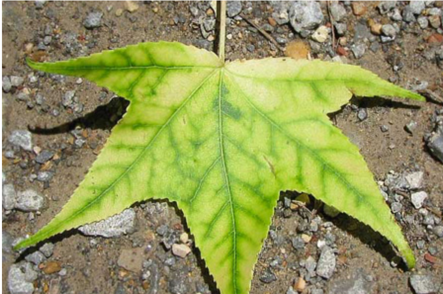
A Liquidambar leaf with interveinal chlorosis Karnataka J. Agric. Sci.,24 (1) : (106-109) 2011

Chlorosis is commonly caused by an inability to synthesise sufficient chlorophyll which can be caused by poor nutrition including a deficiency of Iron, Magnesium and Zinc.