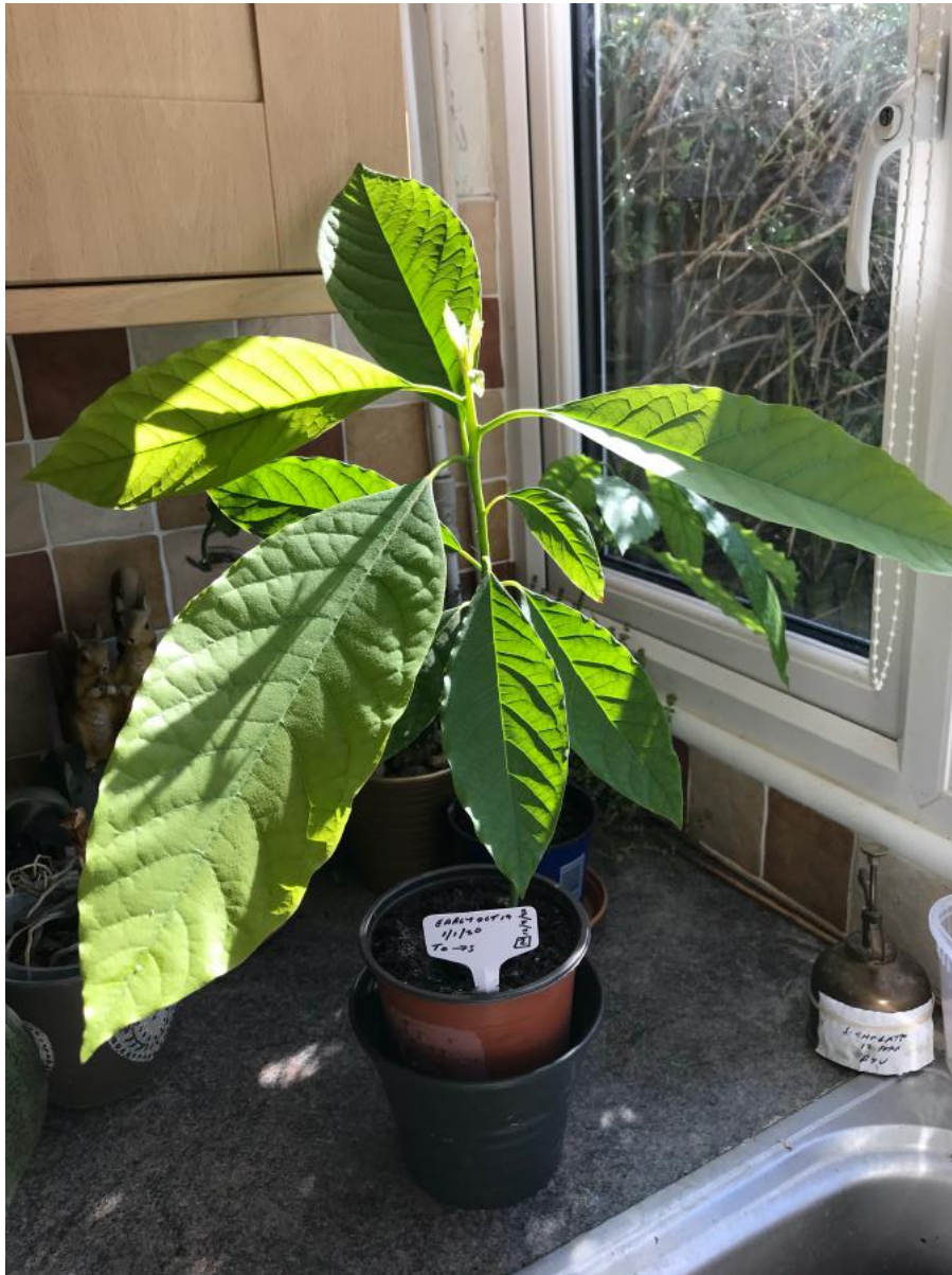
Avocado plant at the end of May 2020, 8 months after starting at the beginning of October 2019