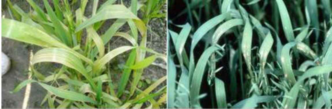
Manganese deficiency symptoms in corn and wheat.

deficiency can cause pale green or yellow patches in younger leaves. This condition is known as grey speck, and is characterized by necrotic spots that form in older leaves (Figure 1).