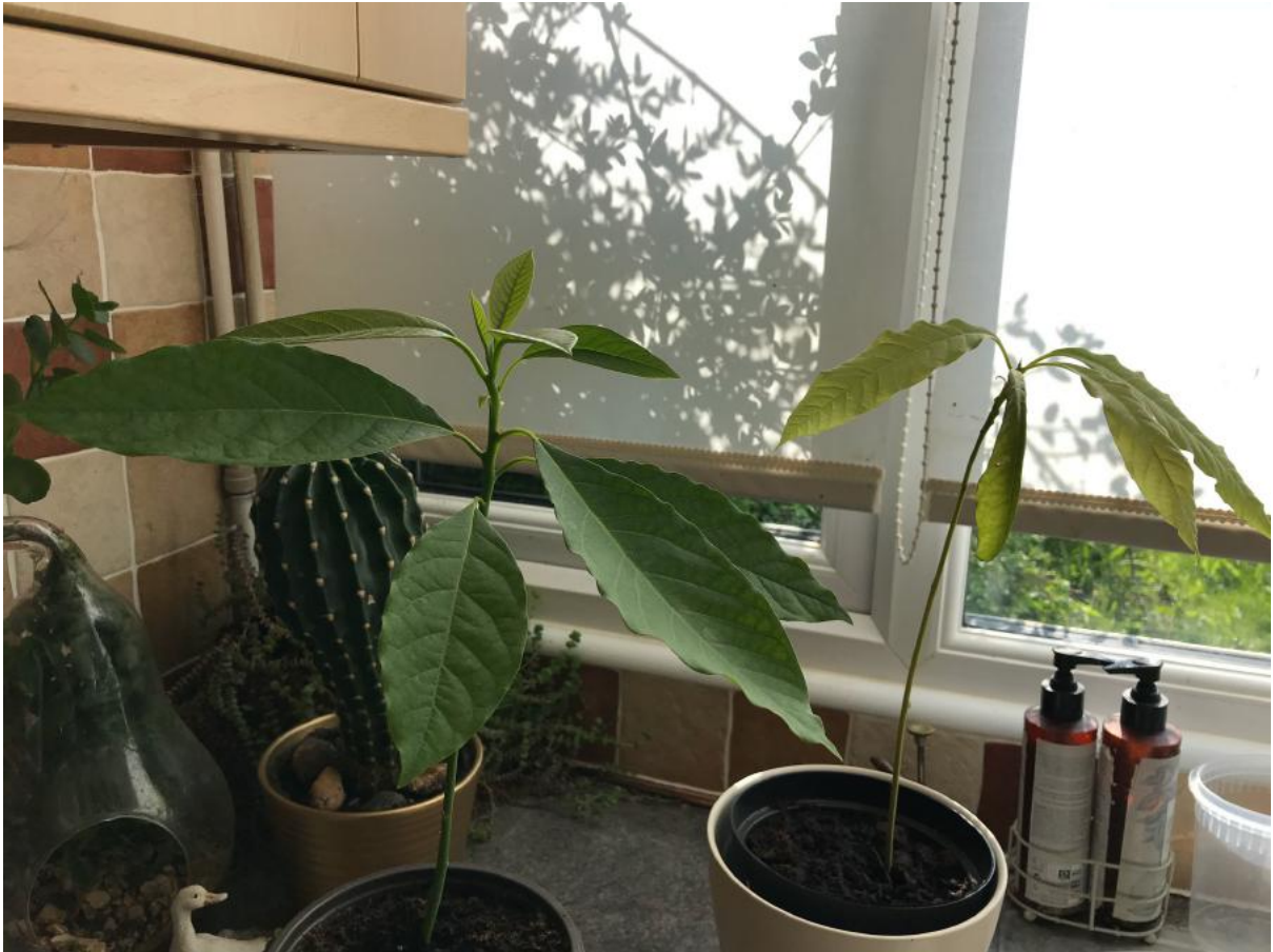
Avocado plants at end of April 2020, 7 months after starting at the beginning of October 2019 - S-Chelate-O 12 Star (left) vs tap water